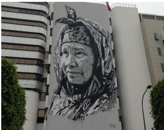
Street art, Rabat, April 2018

In December 2017, the CFG initiated a pilot mediation process between ideological and politically-affiliated students' groups in the University of Rabat – Morocco's largest and oldest modern university. In a sensitive context characterized by high levels of violence on university campuses, we have facilitated safe mediation spaces for an inclusive and diverse group of student representatives.