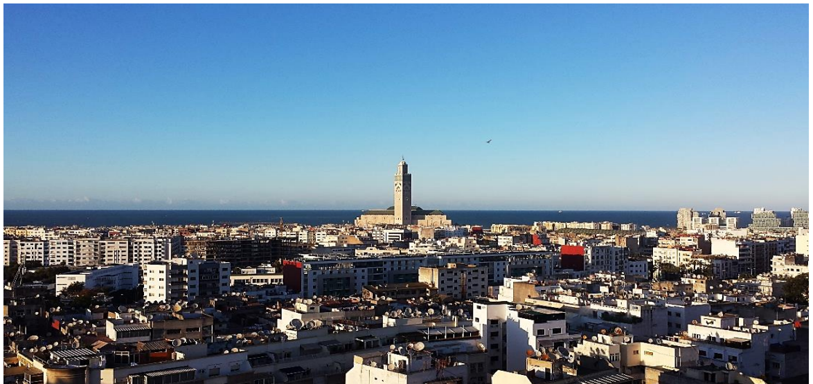
View of Hassan II Mosque, Casablanca, December 2017

The Cordoba Foundation of Geneva (CFG) is an independent non-profit organisation working on peace promotion. We focus on tensions and polarisations in all societies where Muslims live, and aim to enhance theoretical and practical conflict transformation resources in Muslim majority countries. Founded in 2002, we promote a methodology of conflict transformation adapted to and accepted by local peace actors, parties to conflict and communities. With 15 years of experience , the CFG is well-established in Geneva, Switzerland, and has developed unique access and networks in the Muslim-majority world. Our multi-cultural, diverse team of dedicated professionals has enabled us to build relations in both the Western policy and Muslim-majority worlds, guided by our core values of Non-violence, Inclusiveness, Impartiality, Empathy and Independence .